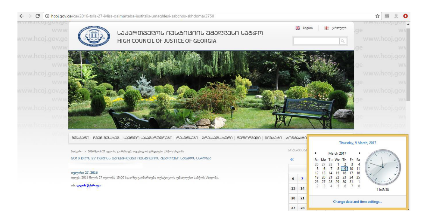
Illustration No 2: The agenda of the session of 27 July was published a few hours before the session.